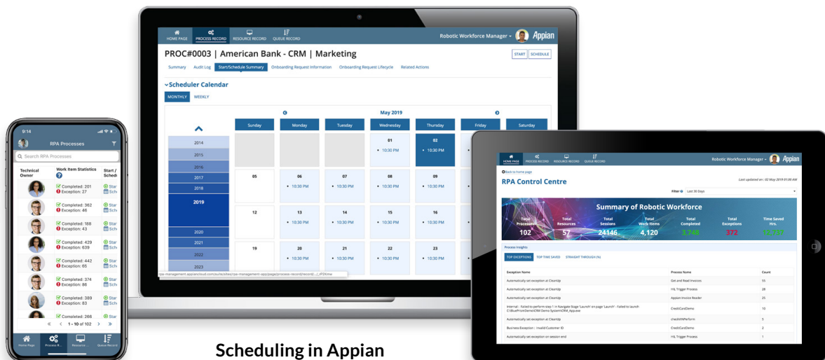
Scheduling in Appian